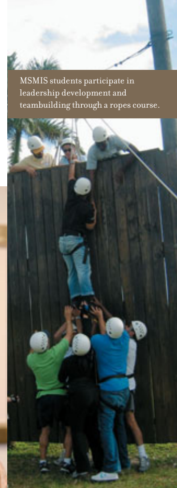
MSMIS students participate in leadership development and teambuilding through a ropes course.