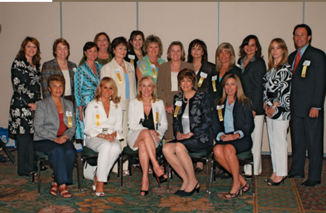
Florida business leaders honored at luncheon unveiling results of 2007 study