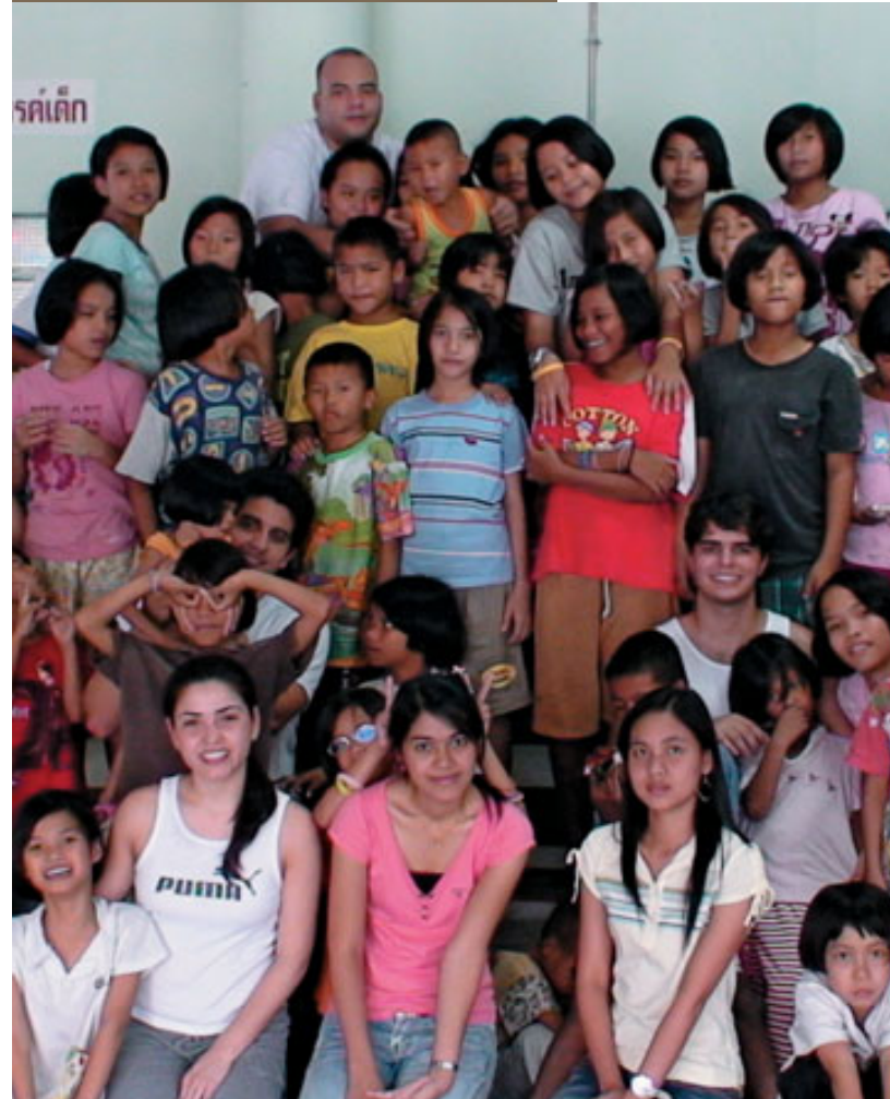
Bangkok’s Children’s Creativity Foundation (CCF)