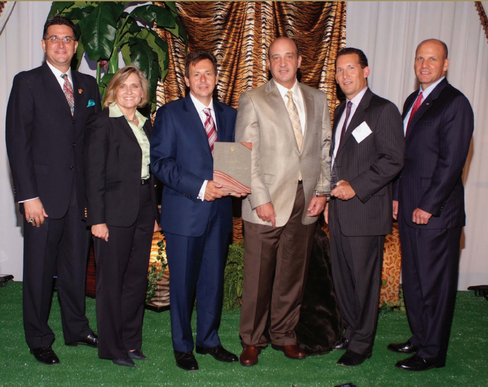
Cover Photo: (caption). Full story, see page 4.